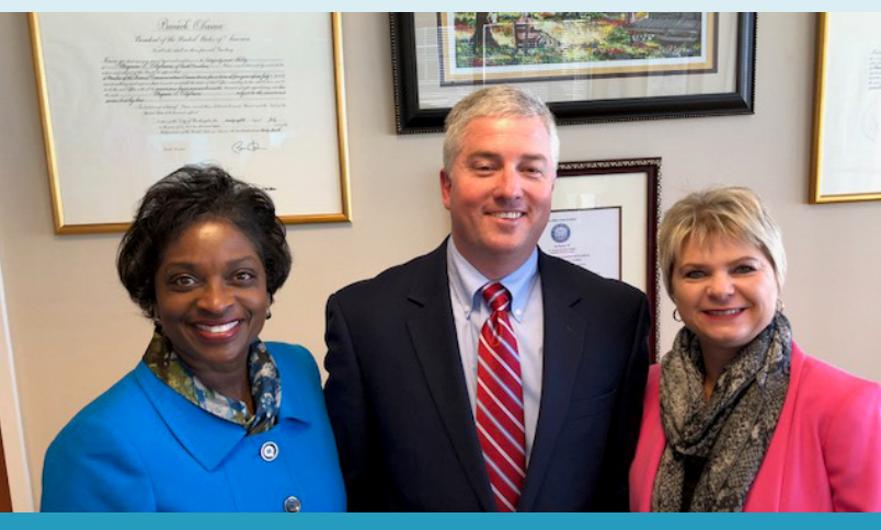
2017 National Telehealth Champion Award Winner Mignon Clyburn, Commissioner Federal Communications Commision (FCC)