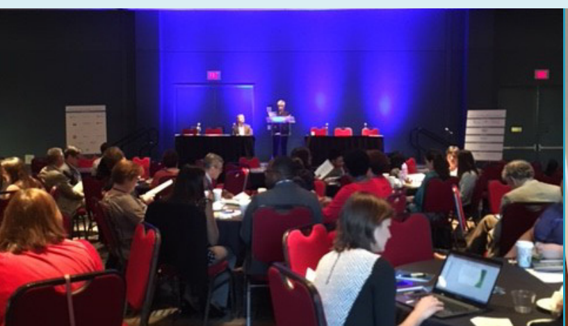
Annual Telehealth Summit of South Carolina

The Annual Telehealth Summit of South Carolina is an educational opportunity that enables many telehealth leaders across the state to network with each other while learning the latest telehealth programs and practices. As the host of this event, Palmetto Care Connections strives to provide the latest trending topics and phenomenal speakers on national, state, and local levels.